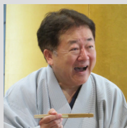
Kanariya Nuts Rakugo Bamboo Mat Show