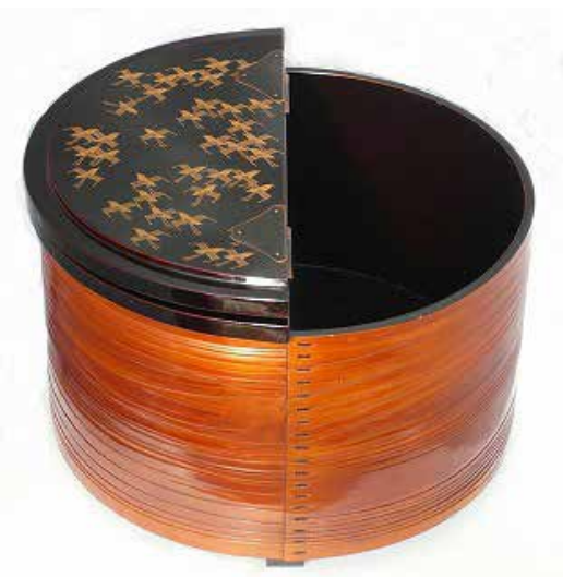
lacquerware with plover motive (Gengensai)