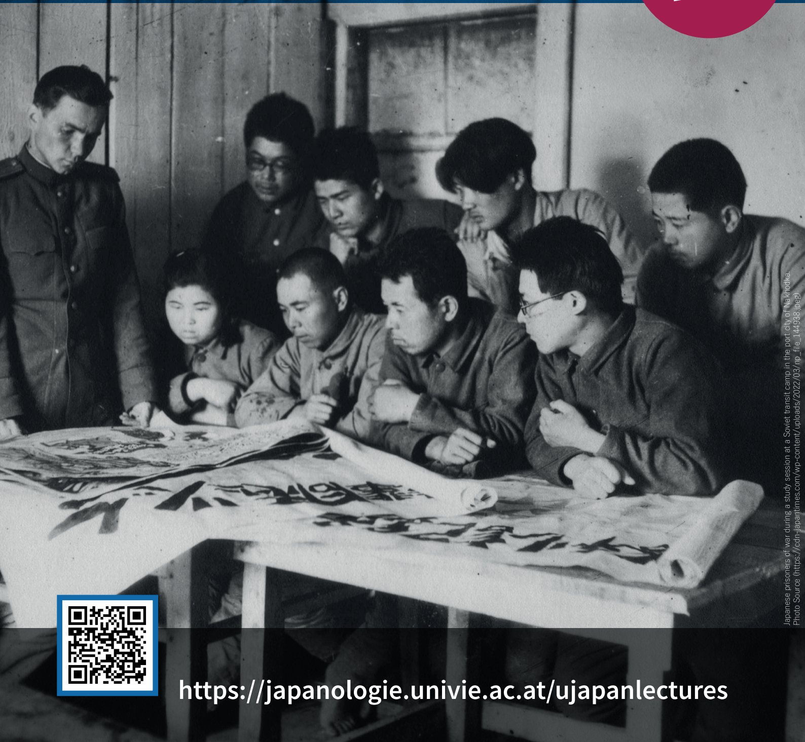
Japanese prisoners of war during a study session at a Soviet transit camp in the port city of Nakhodka.